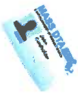
Debit card makes purchases easy!